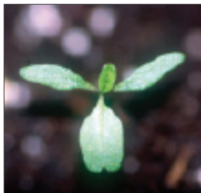
Smooth pigweed seedling.