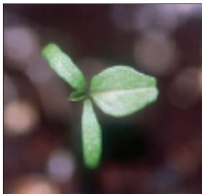
Redroot pigweed seedling.