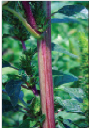
Powell amaranth stem.