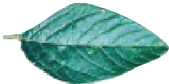
Powell amaranth leaf.