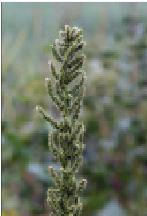
Smooth pigweed seedhead.