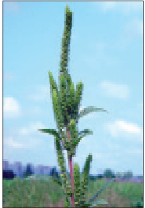
Powell amaranth seedhead.