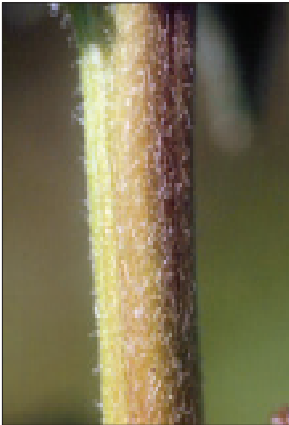
Redroot pigweed stem.

Differs by having hairless leaves, hairless to slightly hairy upper stems, and seedheads with narrower, less dense and less prickly spikes.