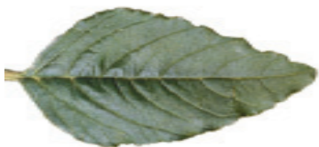
Redroot pigweed leaf.