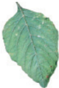
Smooth pigweed leaf.