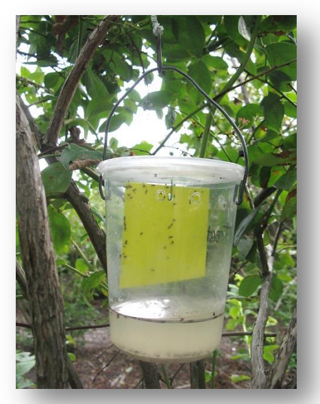
Trap for capturing adult SWD flies.

The traps are baited by adding 1.5-2 inch depth of a yeast-sugar mix, made by combining 1 Tablespoon of active dry yeast (we use Red Star brand) with 4 tablespoons of sugar and 12 oz of water. This ratio produces a solution that ferments and the flies are attracted to the odors. Comparing this mix to apple cider vinegar, we found that SWD were trapped earlier, more of the traps caught SWD, and SWD was trapped in greater numbers than with the apple cider vinegar. Although these traps are harder and messier to service, the yeast bait is less expensive than the apple cider vinegar traps, and the benefits