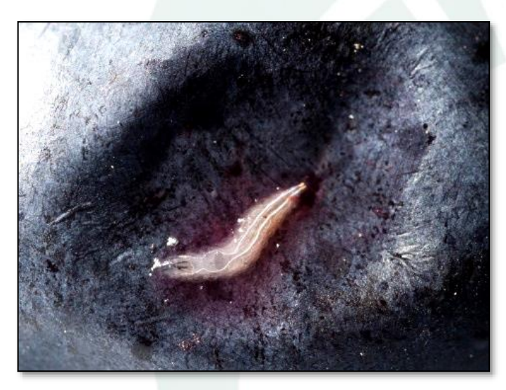
Fig. 3 A large late-instar SWD larvae on a blueberry.

Other insects, in particular native and naturalized fruit flies, look similar to SWD. Thus proper identification is extremely important. You can get help with the identification of adult or larval SWD from your crop consultant or your local extension agent.