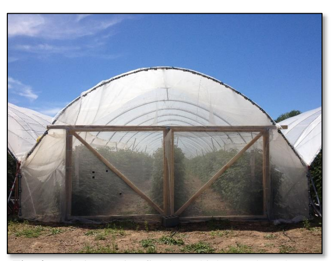
Fig. 4 Exclusion netting fitted to a high tunnel raspberry system, with doors to allow for sprayer access.

Excluding SWD flies from your crop can provide good control of SWD, and may be especially relevant for high-value crops like berries and small fruit. High tunnels or bird netting structures can both be modified for use of insect exclusion nets, but it should be at least 80 gram netting to keep flies out (Figure 4). Netting in our trials was purchased from Berry Protection Solutions in Stephentown, NY and manufactured by Tek-Knit Industries. We found a significant reduction and delay in SWD eggs, larvae, and adults in high tunnels covered with 80 gram netting. However, unless the netting is completely sealed, you can expect colonization within