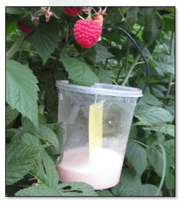
Fig. 2 Yeast-sugar monitoring trap hung within a raspberry canopy.

SWD can be monitored using a simple homemade trap or by buying traps (e.g. Great Lakes IPM). Traps should be placed in your field before fruit begins to ripen to identify if this pest is active. It is best to have multiple traps in each field, and at least one trap should be at the border of your crop, nearest a wooded edge where SWD activity may be earlier. Traps should be hung within the plant canopy in a shaded area and checked weekly. If creating homemade traps, we suggest using a 32 oz. plastic cup with ten 3/16" to 3/8" holes melted or cut within 2" of the top. The small holes allow SWD to enter