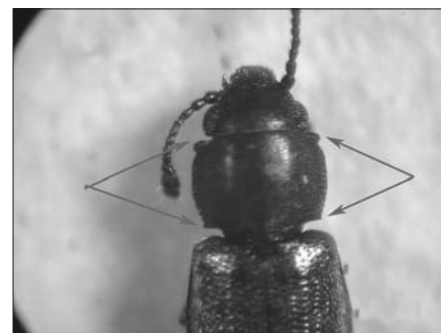
A close up of a foreign grain beetle shows the rounded lobes on the corners of the pronotum.

on damp grain, grain products, and other materials. It is found throughout the world and is very common around grain processing facilities where damp, moldy grain is allowed to accumulate. Little is known about its habits in "nature," however, it is reasonable to assume this beetle can occur in any damp situation where fungi persist. When found around the home, the beetle may come from damp crawlspaces, basements, bark mulch, and possibly moldy flour or flour products. It is also very likely that the beetles originate outside and are attracted to something inside that is damp and moldy. These beetles can fly and are very small, so it is possible for them find their way into the house through screens and around loosely fitting windows and doors. One odd thing about this beetle is that many, if not most, of the specimens sent to the lab were collected from new homes. Possibly, because the wood, plaster, concrete and other building materials in new construction may not be completely dry and support a thin, invisible layer of fungi which attracts the beetles. These insects will stop coming in from the outside as colder fall temperatures arrive. IPM