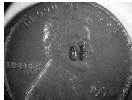
The foreign grain beetle is the smallest of the fall invaders.

The foreign grain beetle , Ahasverus advena (Coleoptera: Cucujidae) feeds primarily on molds and fungi growing