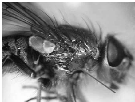
When a cluster fly is viewed from the side, a patch of golden hairs under the wings is easily seen.