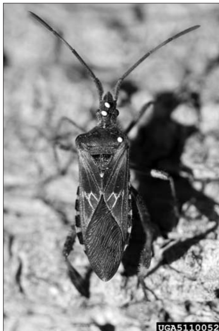
The western conifer seed bug.

in about three days. Newly hatched maggots grab onto earthworms as they slither by and burrow into the worm to feed. Four to five weeks are required to complete a life cycle. The worm does not usually survive the experience. There are up to four generations of cluster flies in Michigan each year. Treating yards with insecticides to kill earthworms has not been shown to be effective in reducing the number of flies entering homes.