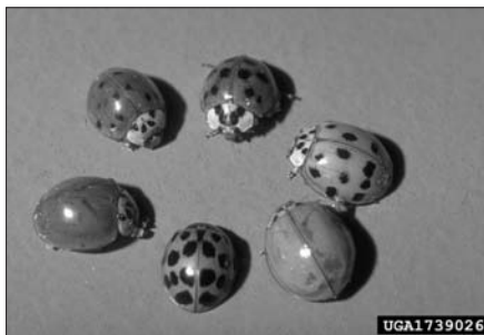
The various colors and spot patterns of the obnoxious multicolored Asian ladybeetle.

The multicolored Asian lady beetle, Harmonia axyridis (Coleoptera: Coccinellidae) is by far the most annoying of the fall invaders. They bite, they stink and they do not keep to themselves like the more considerate boxelder bugs. They can be easily distinguished from other species of lady beetles by their larger size and presence