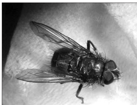
From above, the cluster fly looks pretty much like a garden variety house fly.

The cluster fly, Pollenia rudis (Diptera: Calliphoridae) is another species that enters homes in late summer and early fall in search of protected sites in which to spend the winter. Cluster flies resemble the common house fly but differ in that they have a patch of yellow hairs under their wings. The cluster fly maggot is an internal parasite of earthworms and the flies are among the first to be active in the spring. They can be observed buzzing around yards just above the ground. They lay their eggs in cracks in the soil and the eggs hatch