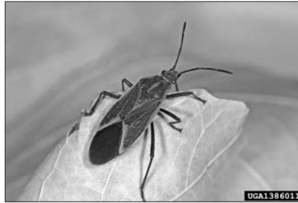
The ever present, but polite boxelder bug.

Boxelder bugs, Leptocoris trivittatus (Hemiptera: Rhopalidae) are the most