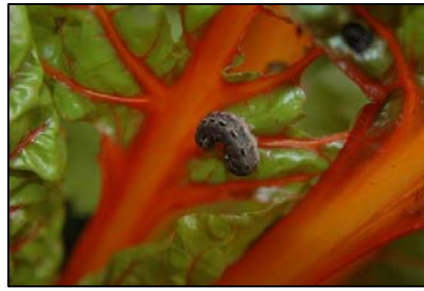
Feeding on Swiss chard in a hoop house at the MSU Student Organic Farm, October 2007. The chard was unmarketable due to defoliation as well as insect excrement (frass) on leaves.