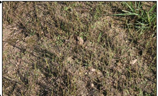
In legume-grass mixtures, larvae prefer to feed on the alfalfa portion of the stand, stripping leaves and leaving the stems. Don't confuse this defoliation with frost damage, which would leave brown leaves.