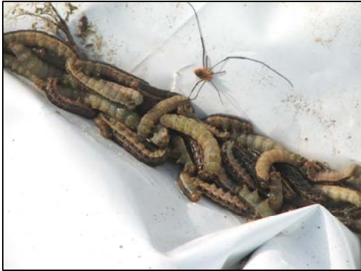
Large numbers of caterpillars were reported around structures. These accumulated on a plastic ag bag covering stored silage in Lake Co.

The host range of Noctua pronuba is wide and includes beets, cabbage, carrot, grape, grasses, lettuce, potato, strawberry, and tomato as well as numerous ornamental plants and weeds. In Michigan, feeding was reported on alfalfa and grass hay, Swiss chard, squash, and sugar beets.