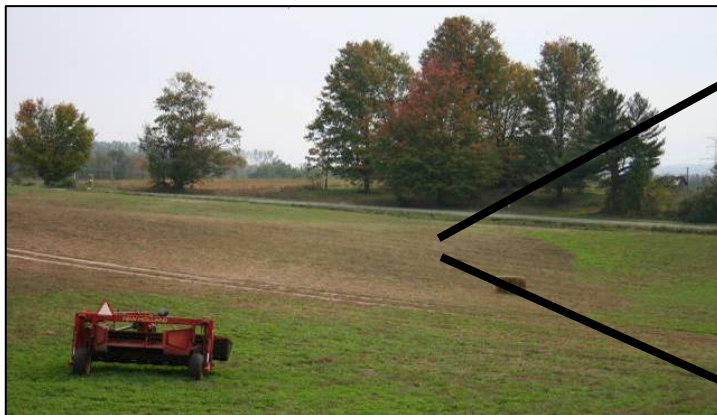
Damage to a hay field in mid-October in Oceana Co., MI. Larvae moved across the field, completely defoliating plants & leaving bare ground (right).