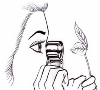
Fig. 1 using a hand lens.