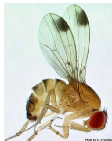
Figure 3. Male spotted wing Drosophila fly with distinctive wing markings. (2 mm long).

Female SWD do not have dots on the wing, so their ovipositor needs to be examined closely in search of its serrated characteristics. Use of a 30 X magnification hand lens or microscope is needed to detect the distinctive saw-toothed ovipositor on female SWD. It is important to check traps for female flies as these often emerge first from overwintering sites.