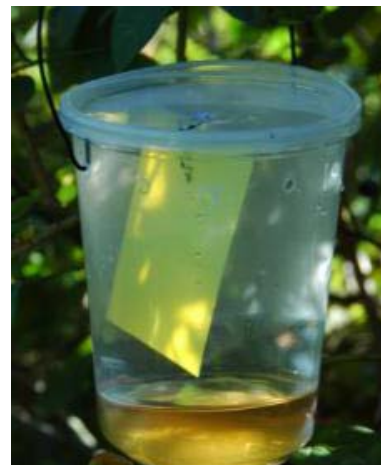
Figure 2. Trap for capturing SWD adult flies.

These flies can be trapped using a simple monitoring trap consisting of a plastic 32oz cup with several 3/16"-3/8" holes around the upper side of the cup, leaving a 3-4 inch section without holes to facilitate pouring out of the liquid attractant, or bait (Figure 2). The holes can be drilled in sturdy containers or burned with a hot wire or soldering iron. The small holes allow access to vinegar flies, but keep out larger flies, moths, etc. Pour one inch of apple cider vinegar into the trap as bait. To help ensure that trapped flies do not escape, a small yellow sticky trap can be placed inside. The traps will also work without the yellow sticky insert, but then a drop of unscented dish soap should be added to the vinegar to ensure flies remain trapped in the liquid.